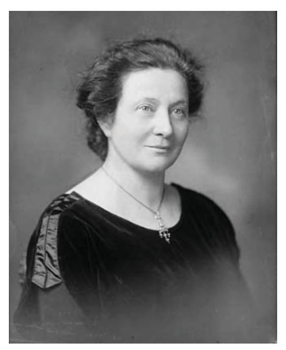
Image 4. Františka F. Plamínková.

The letter was apparently part of the discussion on the LEW's extension to other member states. Although the various proposals for who should and should not be part of the LEW included a discussion of "progressive" or "conservative" streams of feminism, the foreign policy of individual states became decisive for the continuation of the LEW in 1930s.